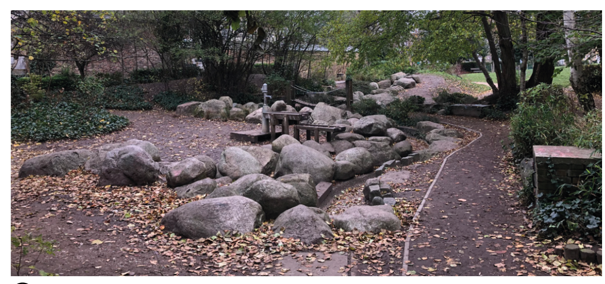
(B) Existing stream bed to become a dry creek bed