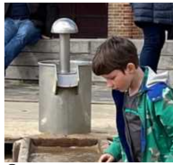
C Proposed water source to replace hand pump