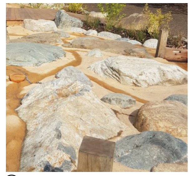
D A new contoured non slip surface will channel the water