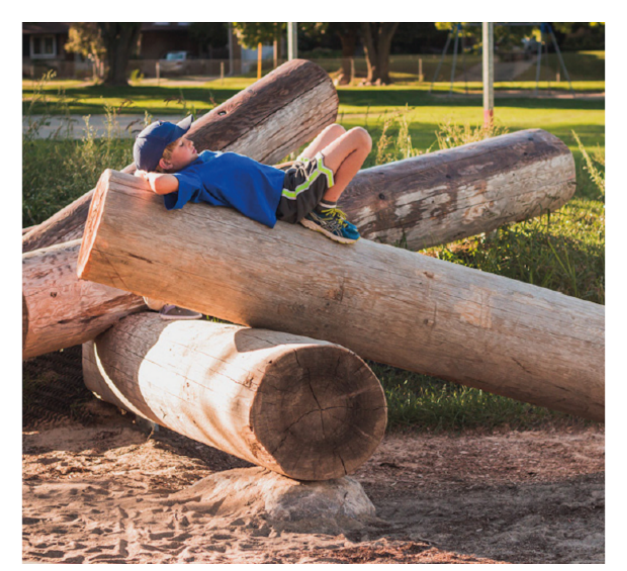
(A) Tree logs