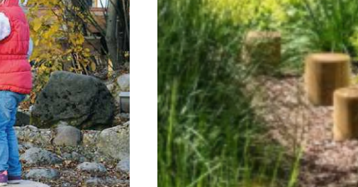
(F) Stepping logs