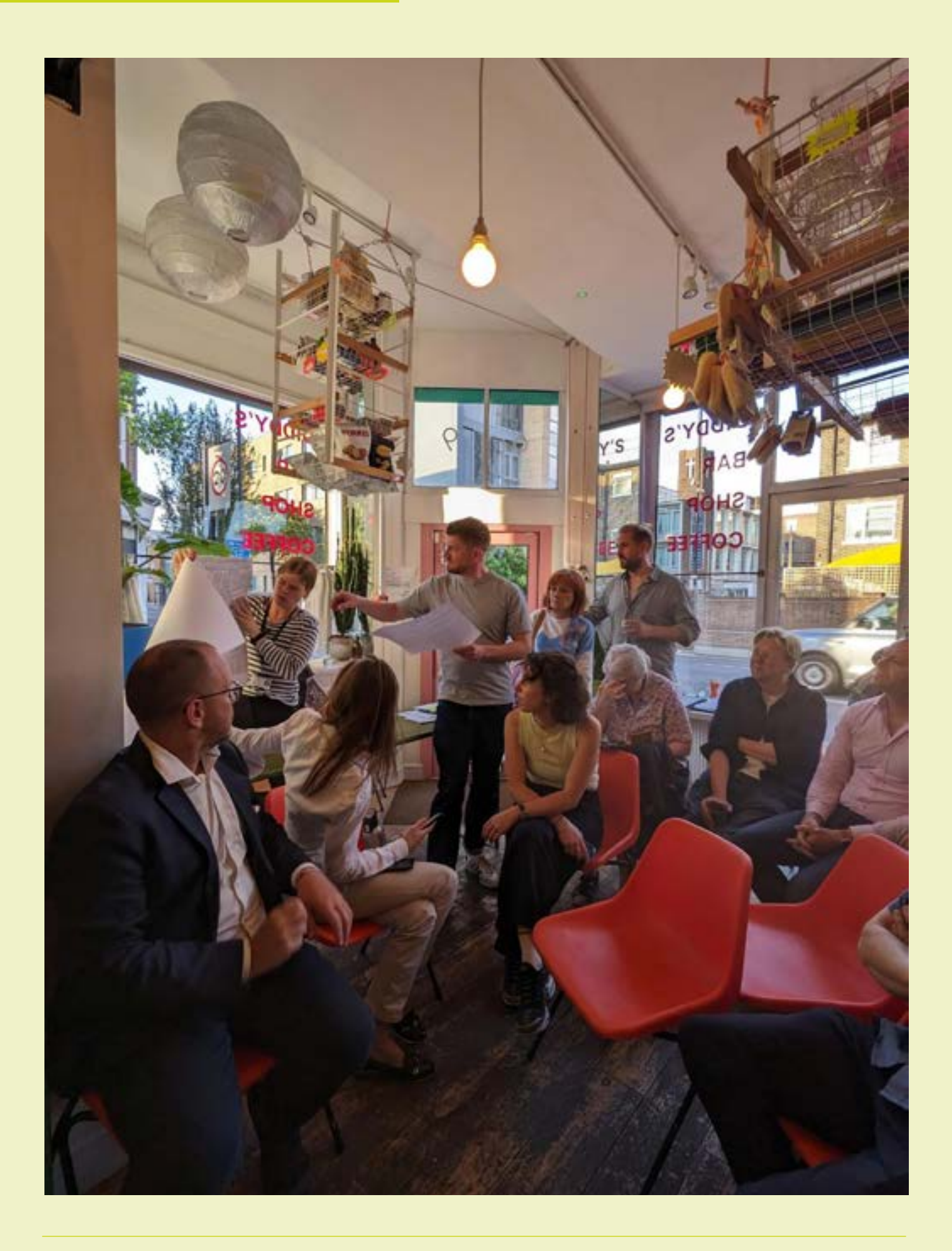
Fig 7: an image of the feedback session at one of the local resident workshops