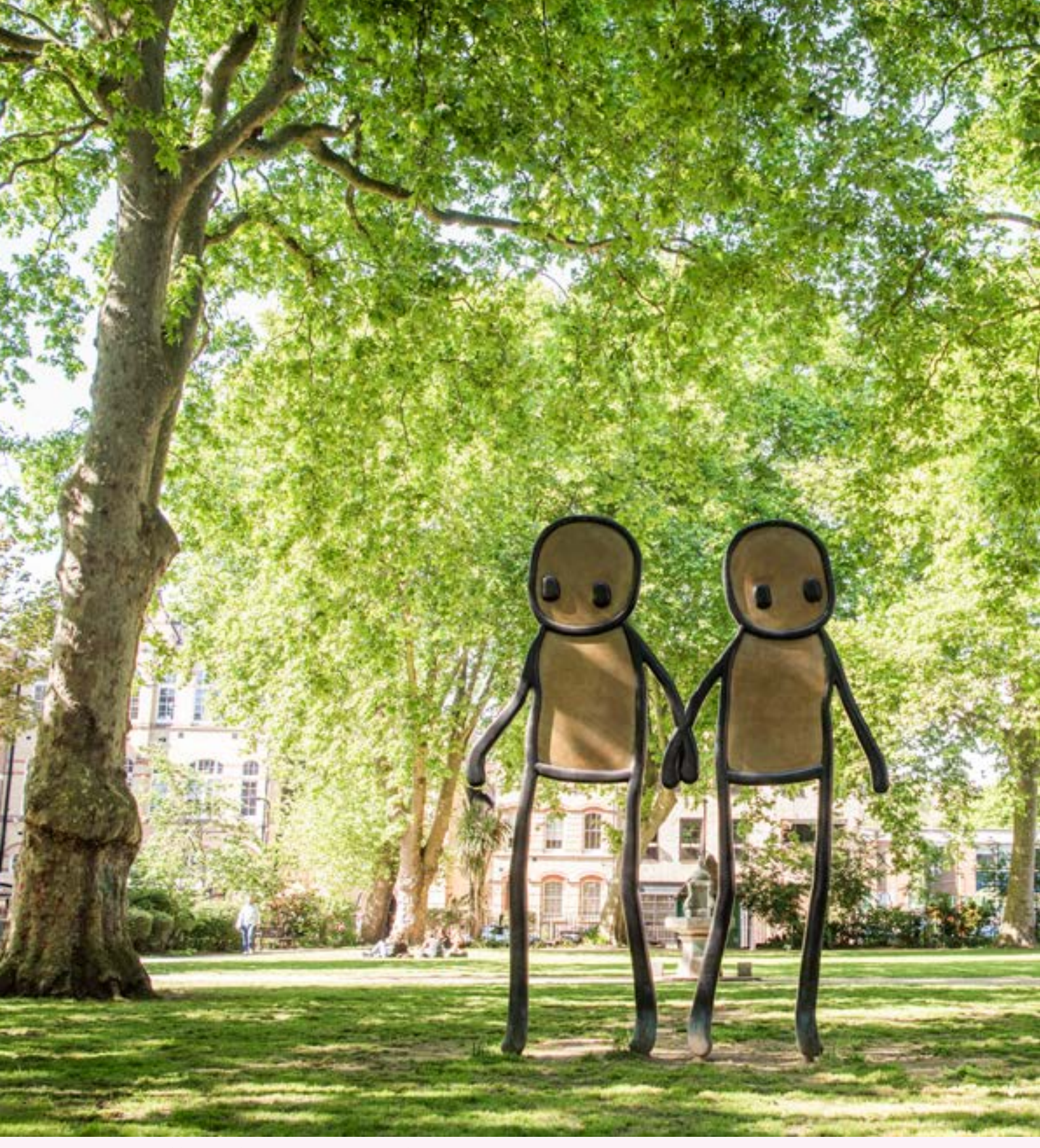
Figure 2. STIX's 'Holding Hands' in Hoxton Square, London