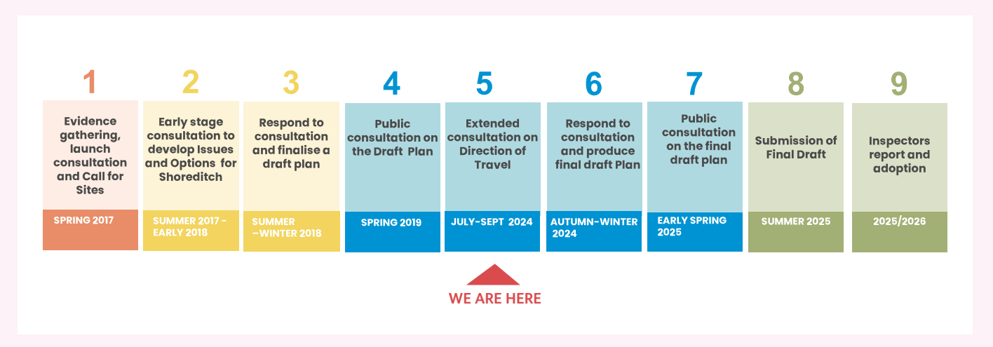
Figure 4. Future Shoreditch Plan-Making Timetable

All comments made at the previous stage of consultation have been worked through by the Council and fed into this Direction of Travel document. They do not need to be resubmitted and will be considered as part of preparing the next version of the plan. The consultation report for the previous consultation has been published alongside this document: