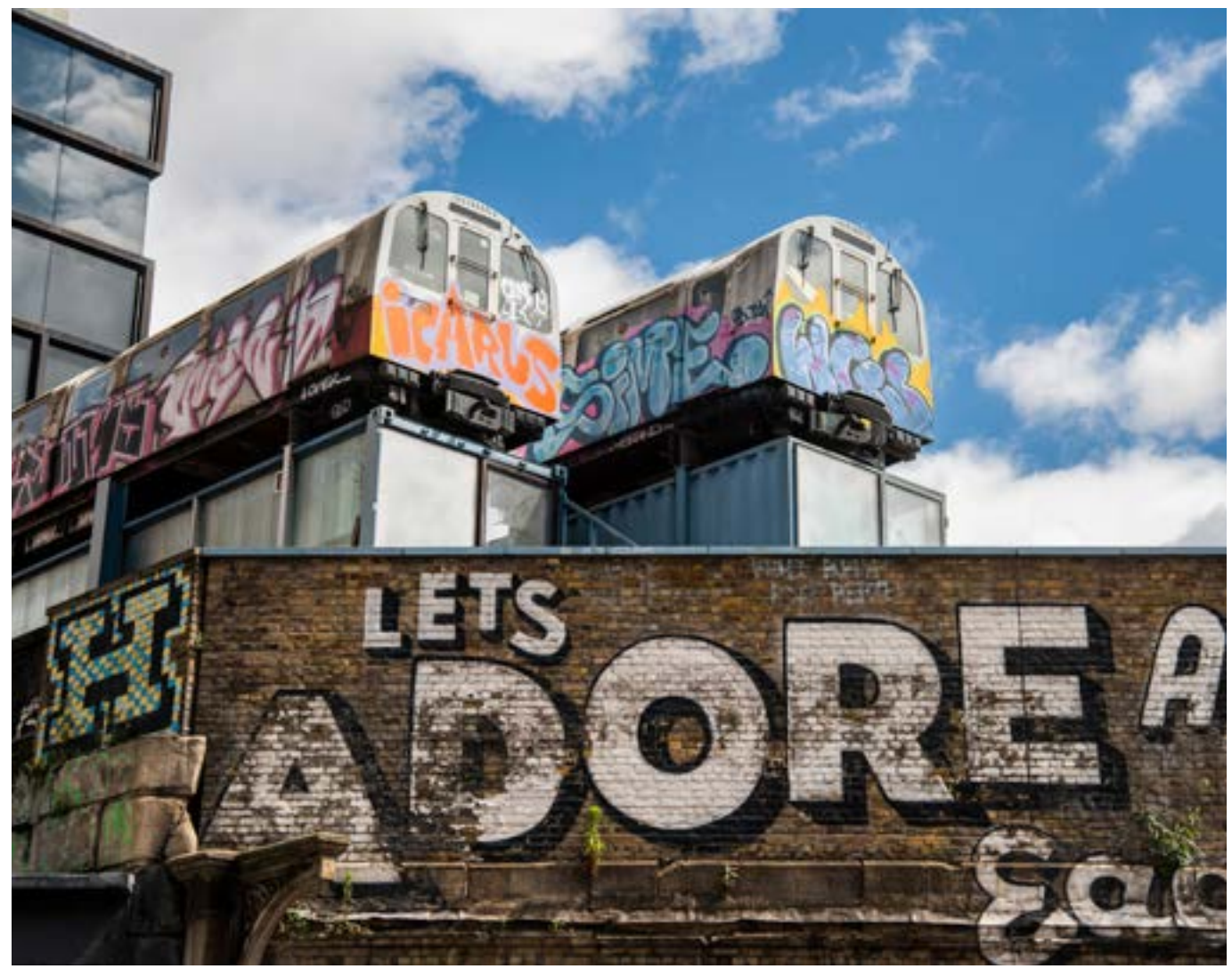
Figure 5. Great Eastern Street

The Direction of Travel sets out that the vision for Shoreditch looks even further ahead to 2040.