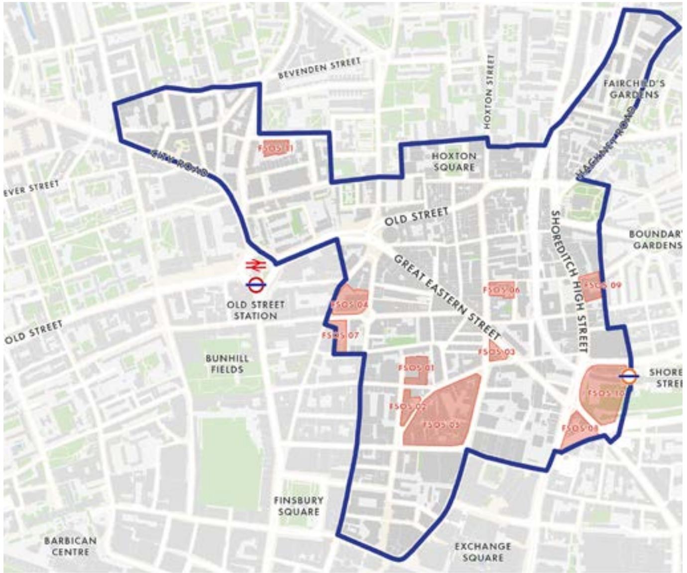
Figure 6. Future Shoreditch AAP boundary

The draft plan provides detailed planning and design guidance on the preferred use(s), mix, scale, height, massing, and accessibility of future development for eleven opportunity sites.