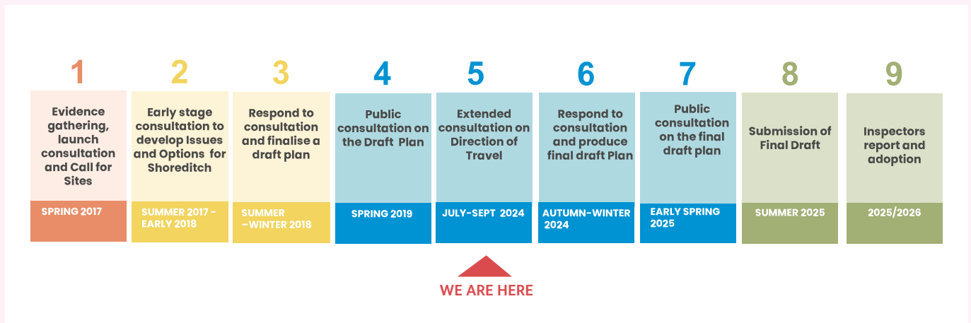
Figure 4. Future Shoreditch Plan-Making Timetable

All comments made at the previous stage of consultation have been worked through by the Council and fed into this Direction of Travel document. They do not need to be resubmitted and will be considered as part of preparing the next version of the plan. The consultation report for the previous consultation has been published alongside this document: