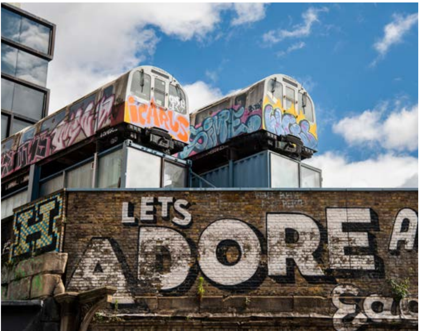
Figure 5. Great Eastern Street

The Direction of Travel sets out that the vision for Shoreditch looks even further ahead to 2040.