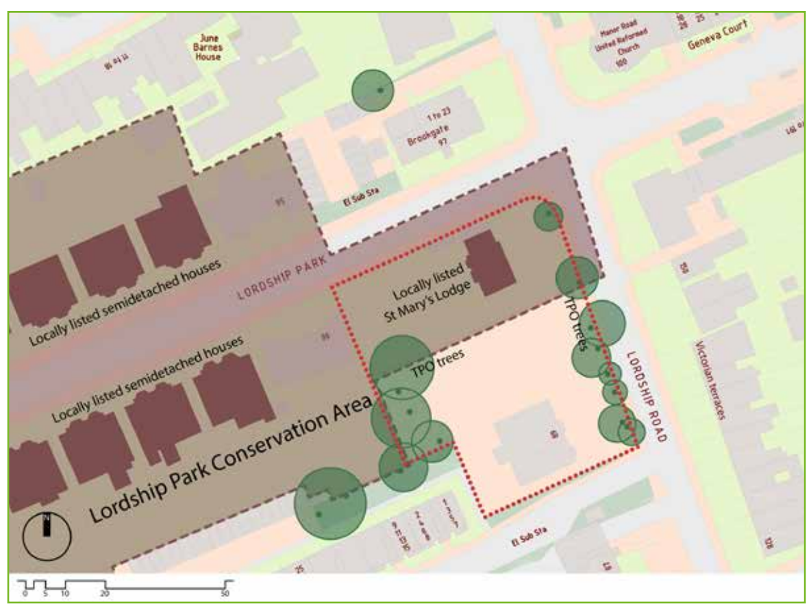
Figure 5. Conservation area boundary

4.11 The site is occupied by the now derelict building St Mary's Lodge at 73 Lordship Road and the TEC Synagogue building at 69 Lordship Road. The site is flat and substantially vacant apart for the aforementioned buildings and TPO trees. Most of 69 and 71 Lordship Road is essentially hard stand area which is used as car parking with the synagogue building on the southern half of the site.