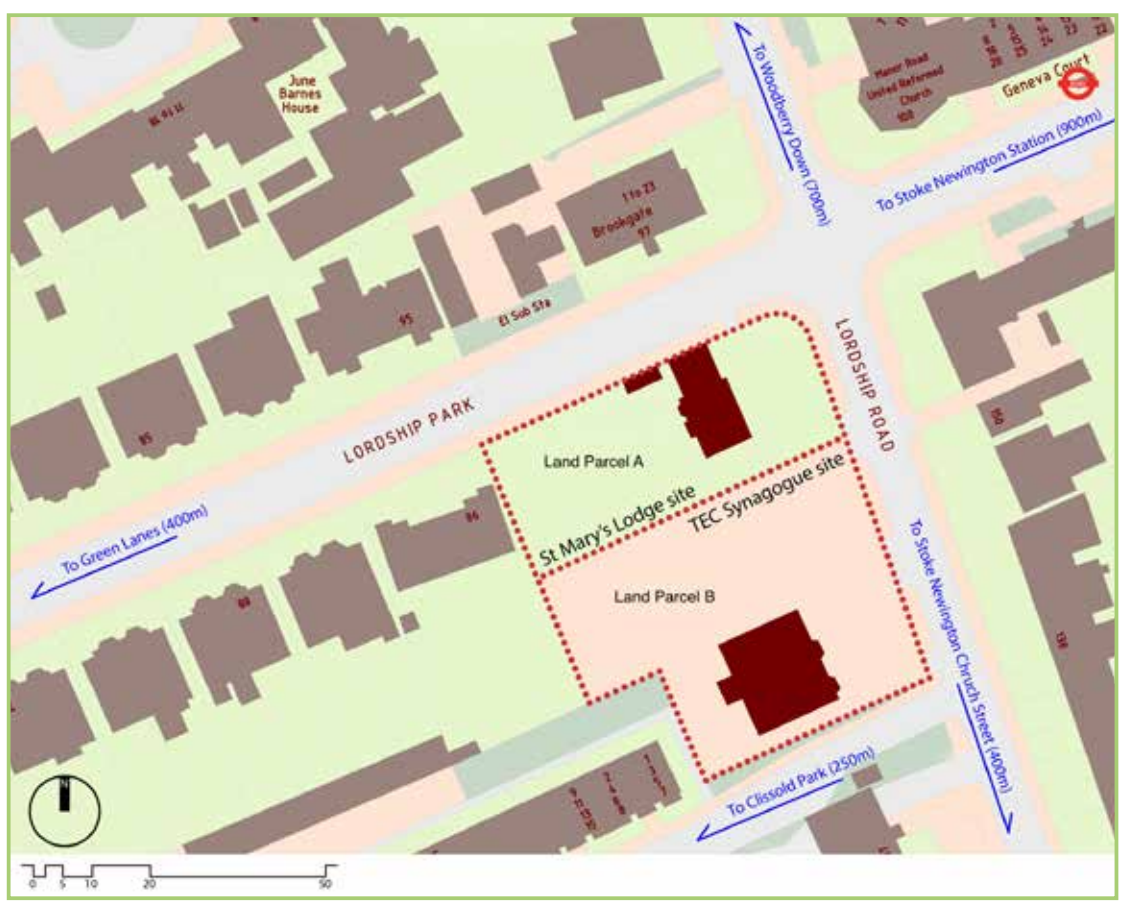
Figure 4. Site accessibility

4.5 The site is slightly isolated from public transport. Two bus stops for the 106 bus service are nearby, bus services 141 and 341 on Green lanes (400m to the west) and 900 metres to Stoke Newington Station to the east.