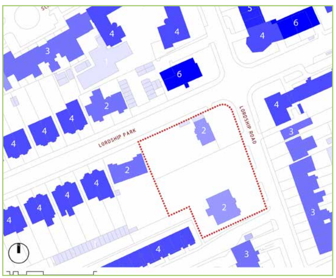
Figure 3. Building heights