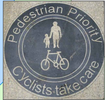
Example of shared surface paving slabs