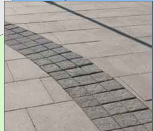
Example of shared surface edging