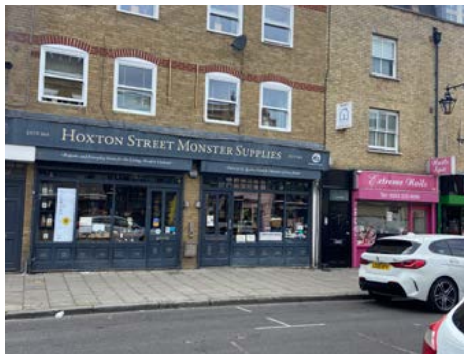
Ministry of Stories - Hoxton Monster Supply Shopfront