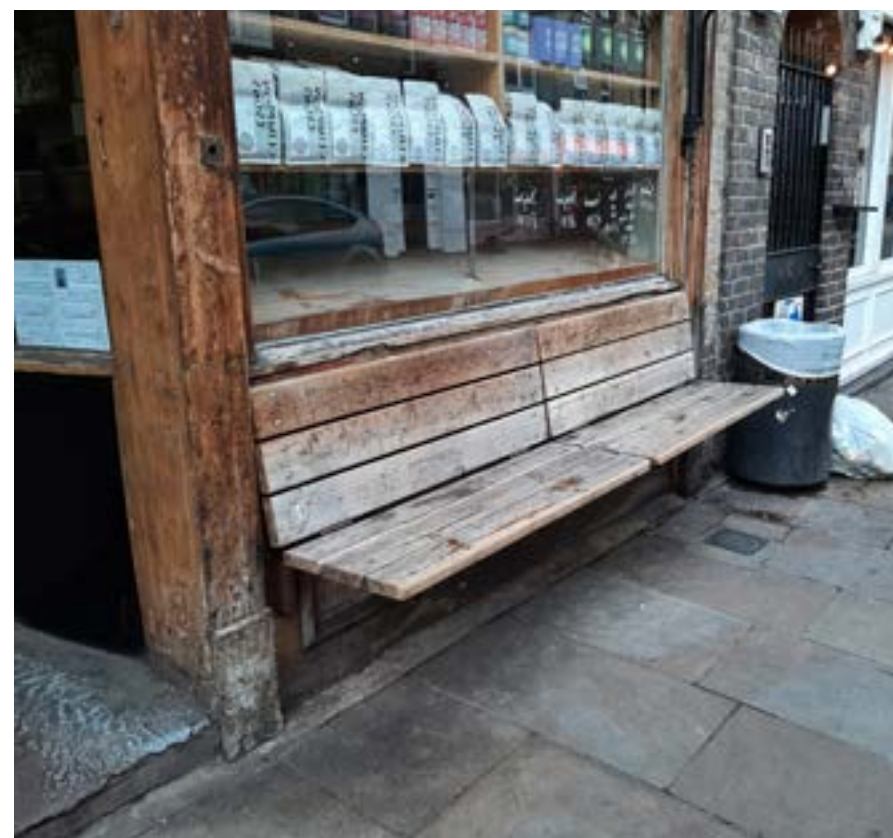
Precedent - Fold down benches, Hackney