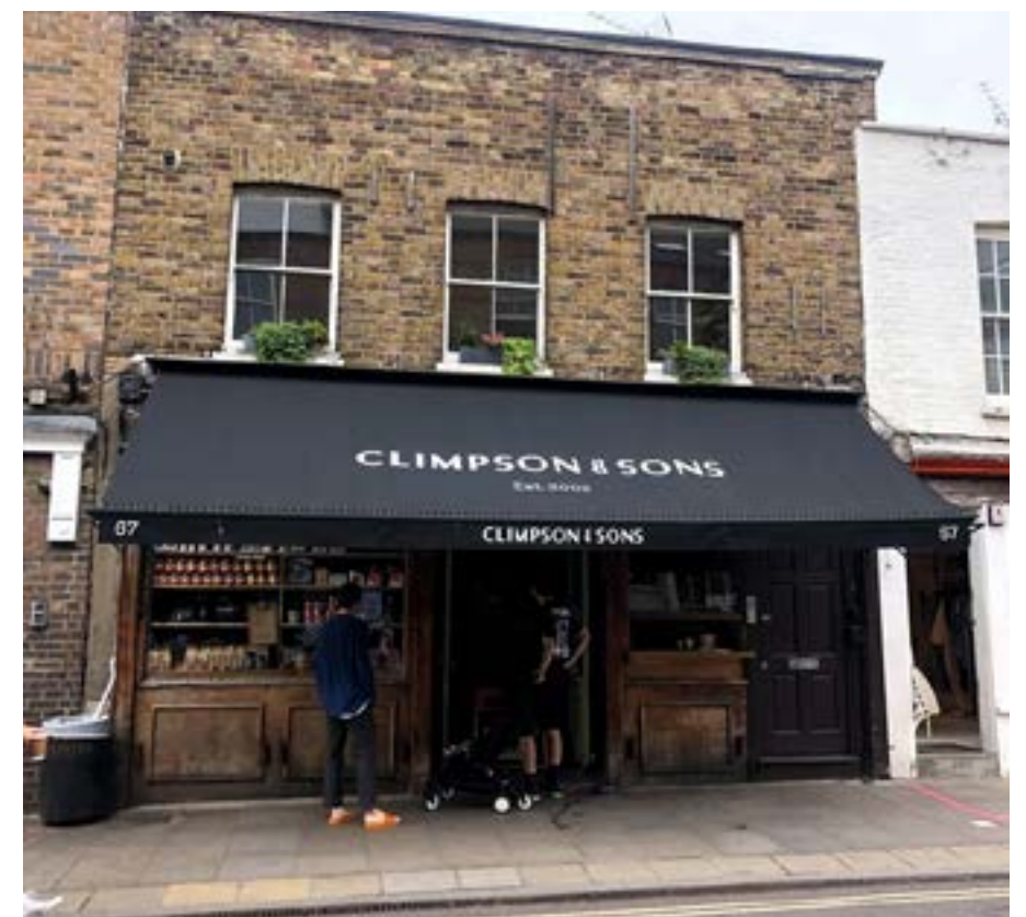
Precedent - Awning, Hackney