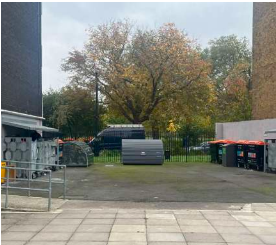
Existing bin store area