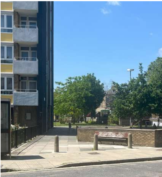
Existing entrance area