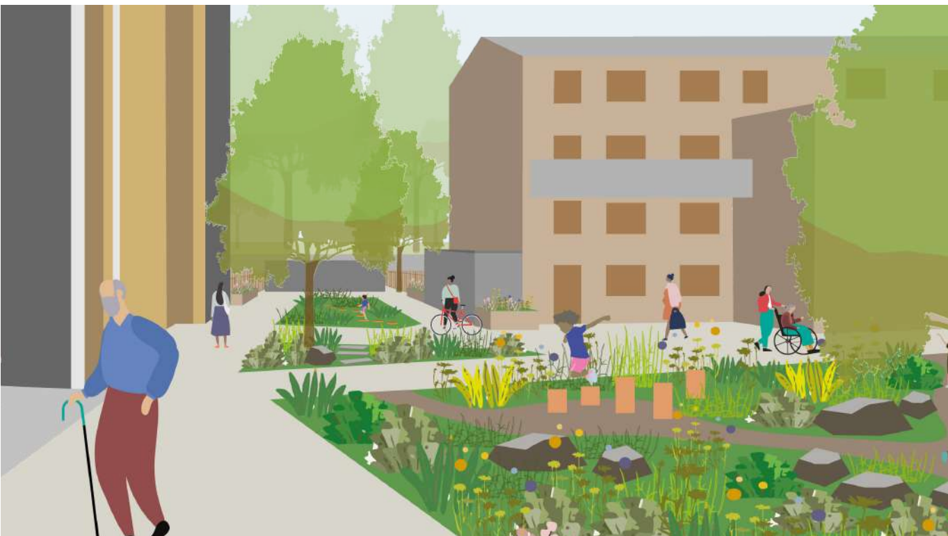
Looking from inside the estate towards Richmond Road