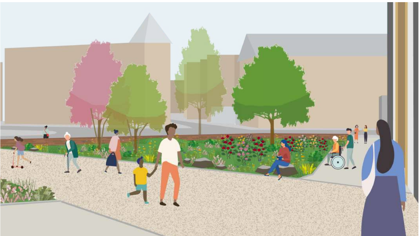
Estate entrance, looking towards Eleanor Road