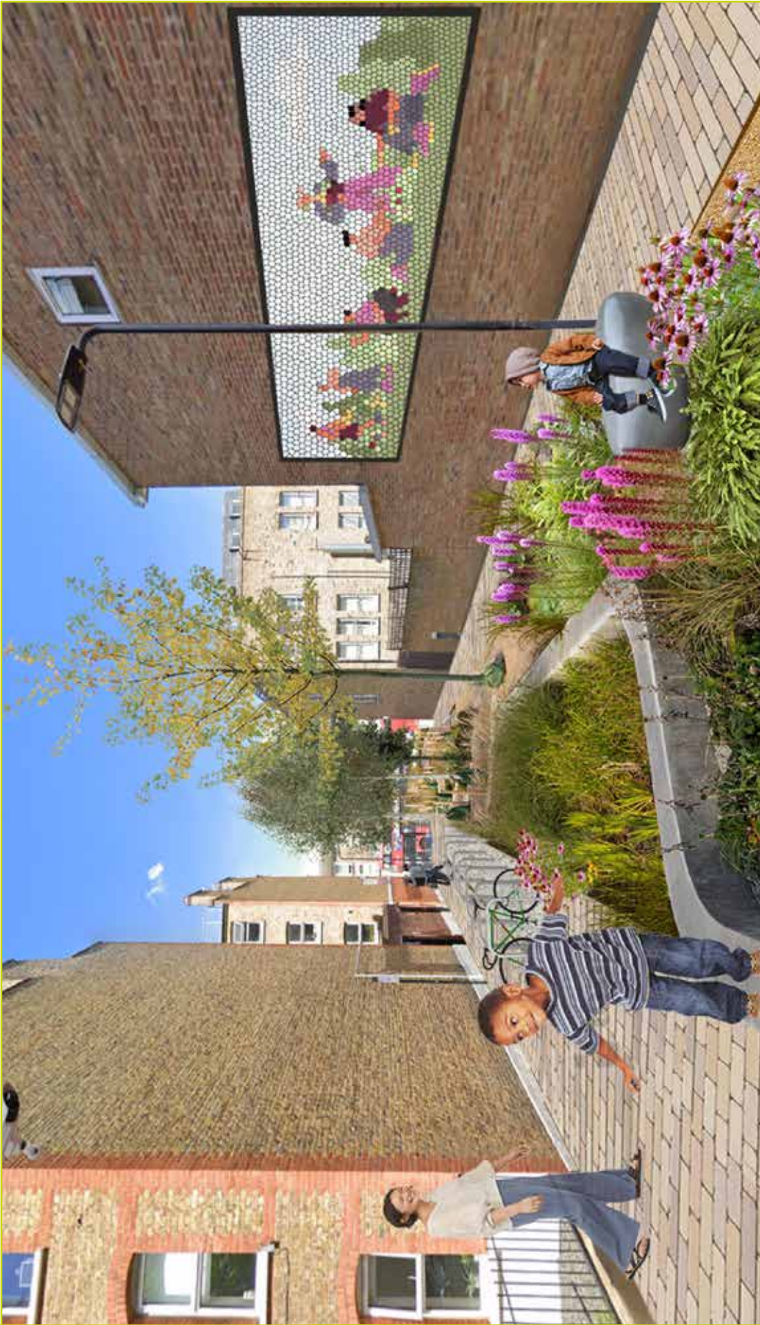
Artist’s impression of a pedestrianised Marvin Street

In addition to the changes proposed for Marvin