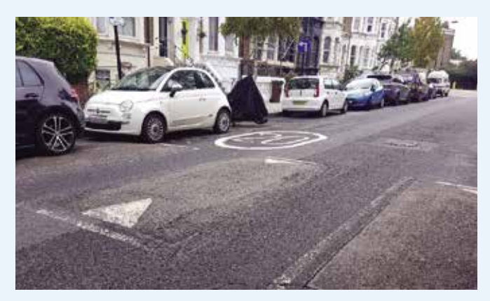
Example of a speed cushion

Introduce an additional set of traffic calming measures along Albion Road to reduce traffic speeds for vehicles that do not adhere to the existing 20mph speed limit. The additional speed cushions would ensure that the traffic calming features are spaced out at an equal distance, thereby achieving lower speeds throughout the road.