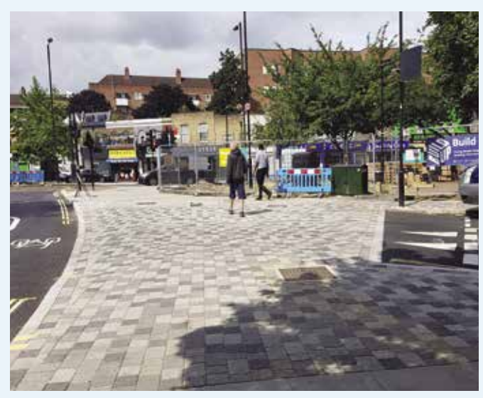
Example of a blended crossing