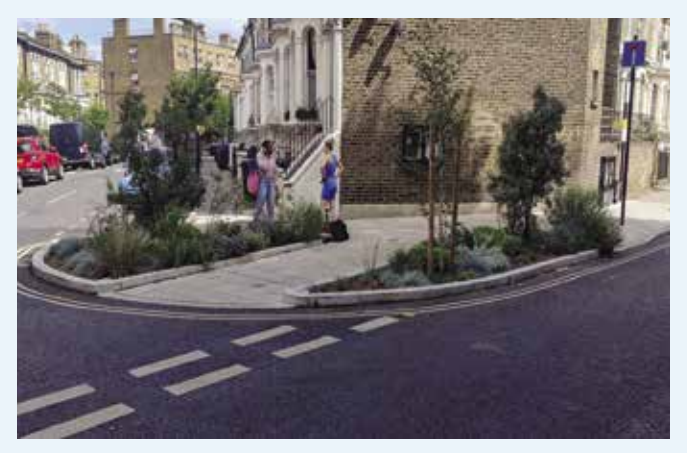
Example of a sustainable urban drainage system (SuDS)

• A build-out opposite Carysfort Road, to realign and reduce the carriageway width. This would also accommodate urban greening such as trees and low level plants and sustainable urban drainage systems (SuDS).