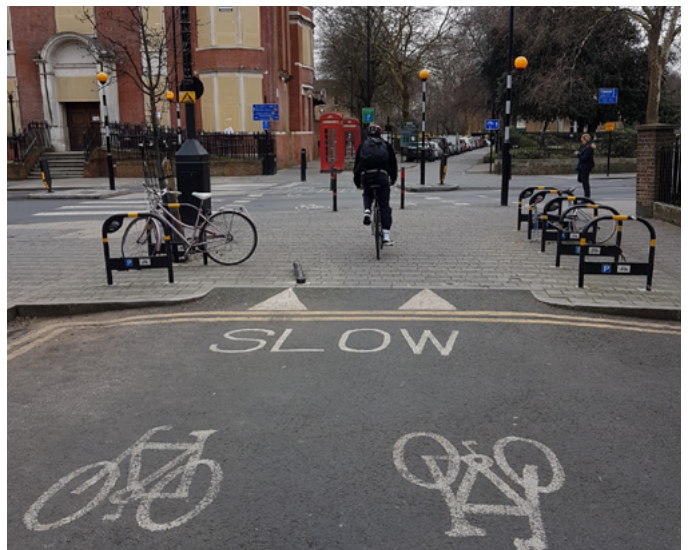
The Existing Road Closure at Lower Clapton Road and Clapton Square