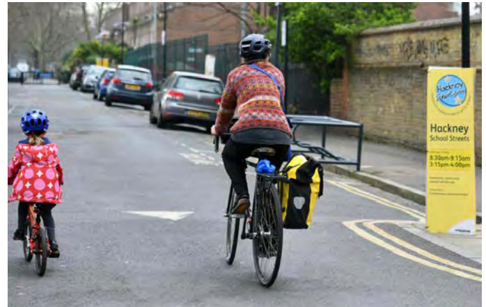
An example of a School Street in Hackney.

As part of this programme, we want to provide more outdoor space for children and young people, and encourage more walking, wheeling and cycling to school. We propose restricting a short section of road at the Shacklewell Lane end of Arcola Street to support this. Access to Arcola Street would be available only from the A10 direction, with a closure at the Shacklewell Lane end.