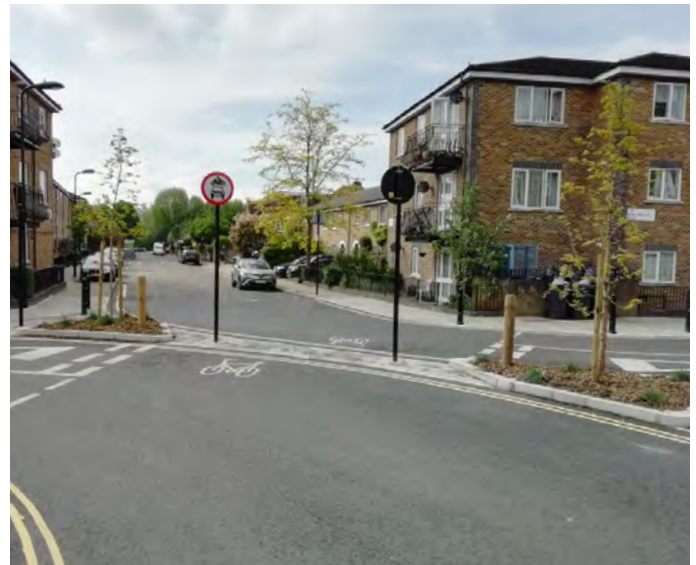
Example of a diagonal traffic filter.