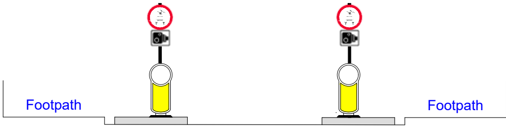
View showing "no motor vehicle" signing and plain face reflective bollards located on traffic islands, as you approach.