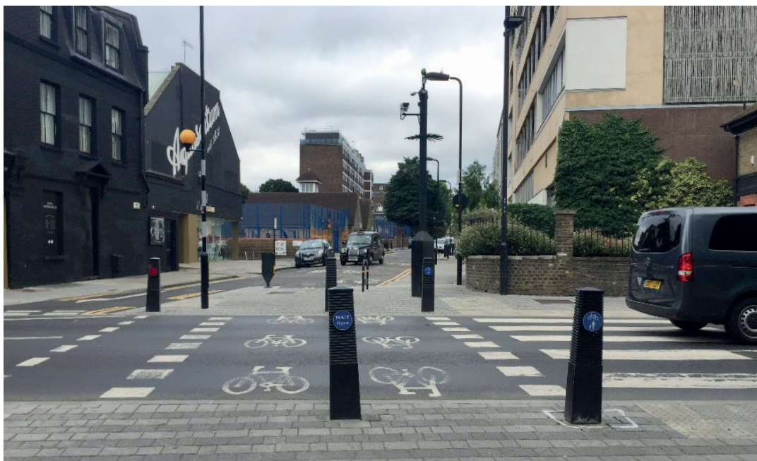
An example of an existing parallel crossing

Also, as you may be aware, TfL have also proposed introducing road closures on the A10 Kingsland Road at the junctions of Stamford Road and Tottenham Road. These closures are independent from this proposed crossing and we are awaiting further details from TfL on when these are likely to be introduced.