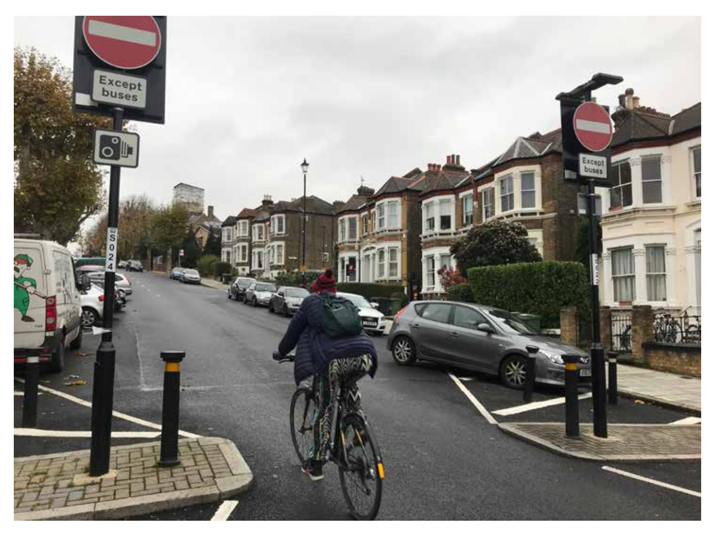
Example of a bus gate. The final design may differ from that shown in the picture.