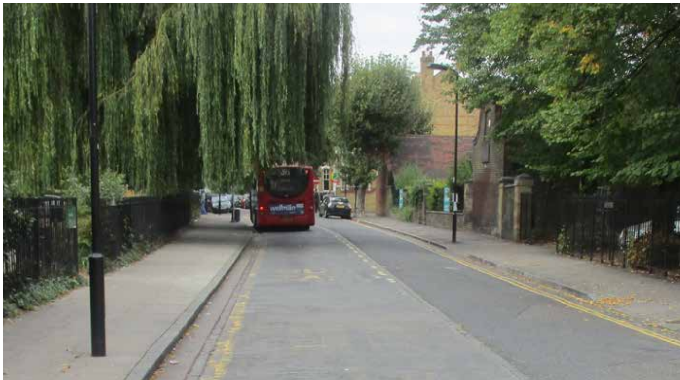
Lower Clapton east of Clapton Pond

This document sets out Hackney Council's proposals and seeks the views of residents on improvements to be carried out at Lower Clapton Road to the east of Clapton Pond.