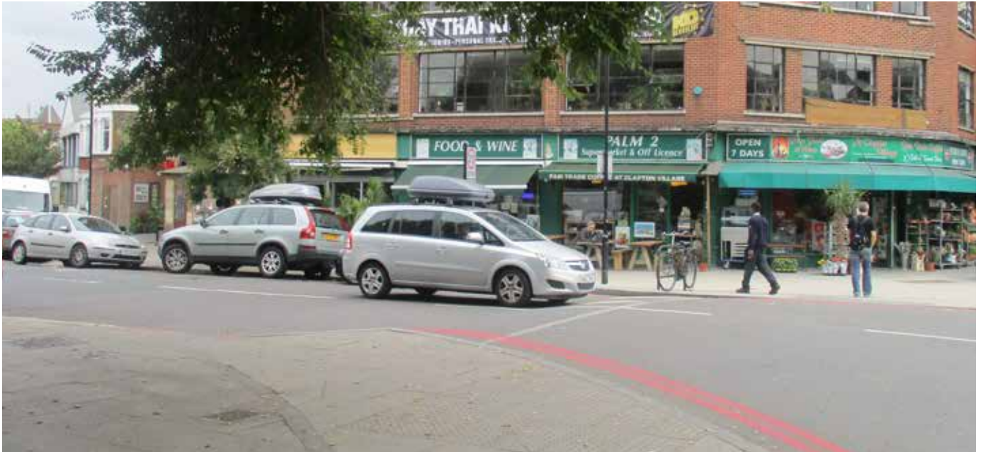
Millfields Road / Lower Clapton Road junction