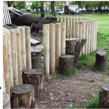
15. Playable entrance feature