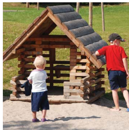
3. Small Playing House