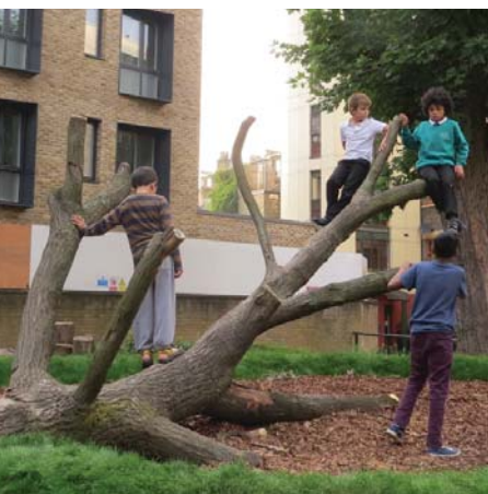
1. Fallen tree climbing feature