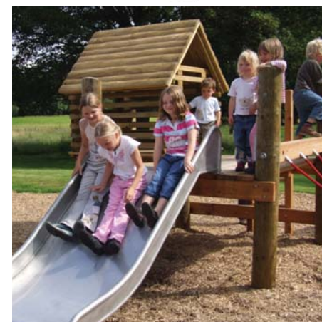
5. Platform House 4904