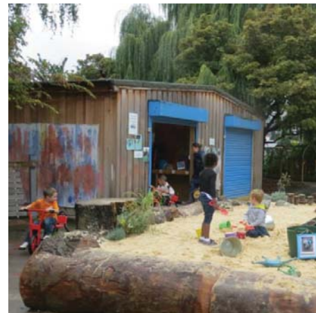
14. Reclaimed timber edging