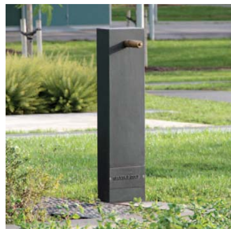
6. Atlantida drinking fountain