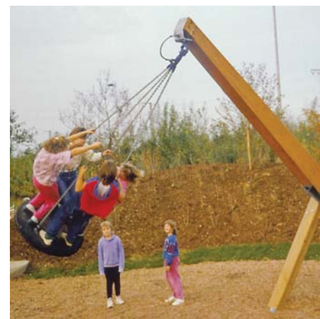
4. Car Tyre Swing