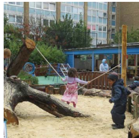
13. Play sand safety surfacing