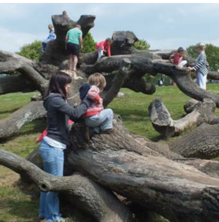
1. Fallen tree climbing feature