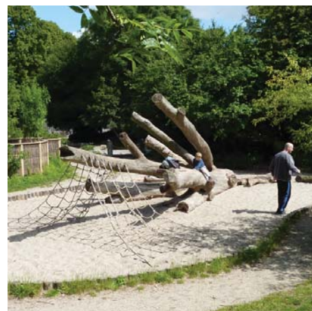
1. Fallen tree climbing feature