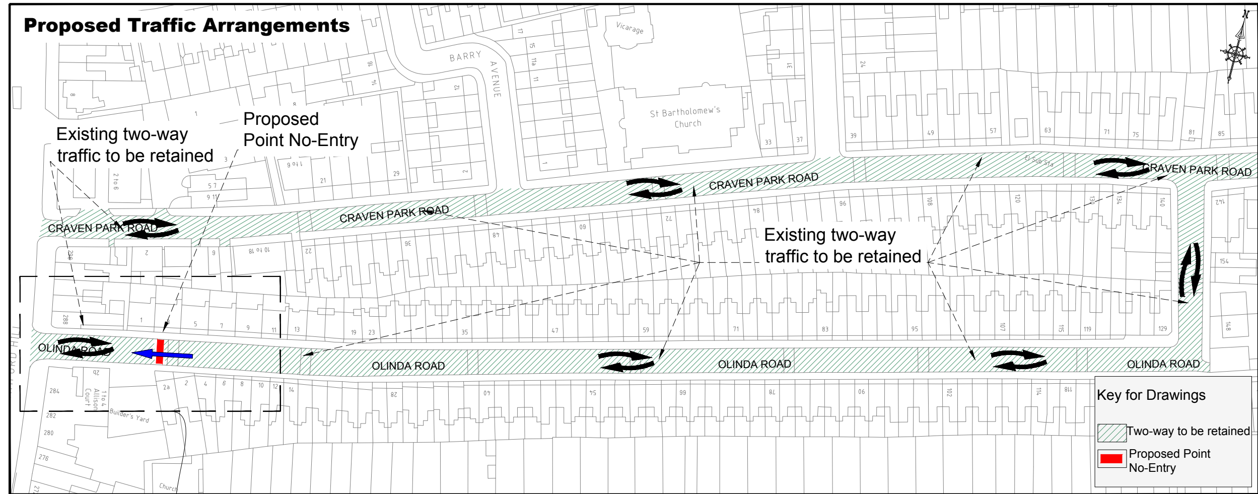
Detail View : Proposed Point No-Entry