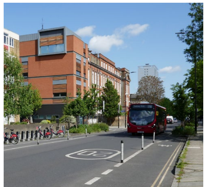
Example of cycle lanes using wands