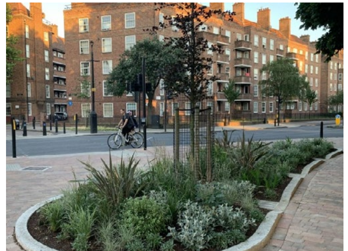
Example of existing rain garden at the corner of Cricketfield Road and Queensdown Road.

We'll consider your request and get back to you in 5 working days.