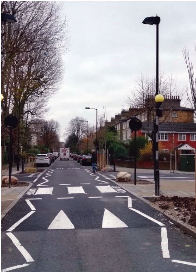
Example of a speed table

Should the proposals be implemented following consultation, we expect construction works to start in early 2024 with completion in about 12 weeks. Further information regarding the works will be sent out closer to the time.