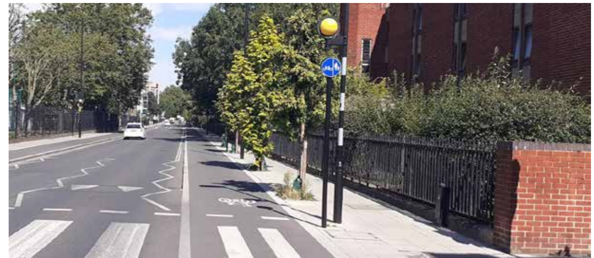
Photo 1: Example of a raised zebra crossing, protected cycle tracks and blended pedestrian crossing in block paving

Please refer to the drawings enclosed for the layout details of this scheme.