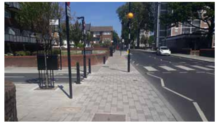
Example of a blended crossing implemented in Hackney

For details of the proposals please refer to the drawing on page 3 and 4.