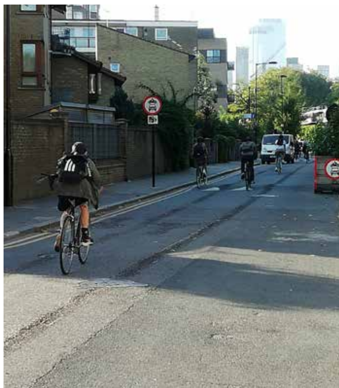
Existing modal filter on Pitfield Street

The Council has also received complaints about the level of traffic on other roads surrounding the area such as Whitmore Road / De Beauvoir Road, and will be investigating these as part of a potential separate scheme.