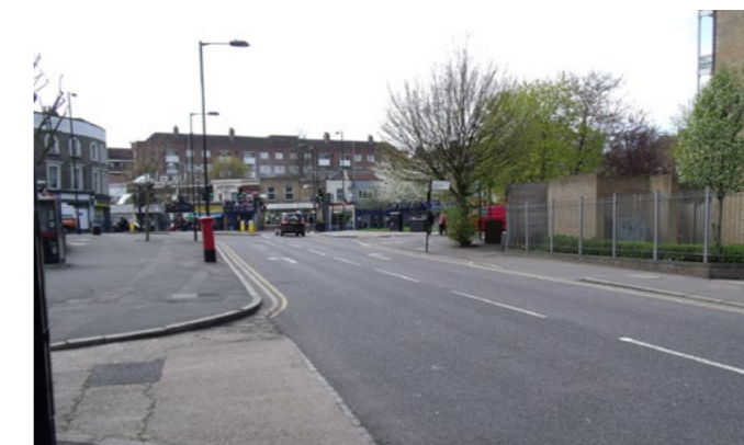
View east – Wick Road towards Morning Lane