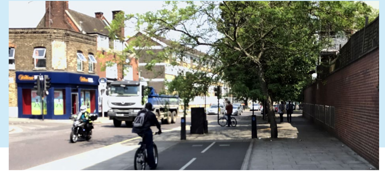
Wick Road – view east