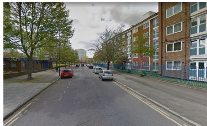
Wick Road – view west