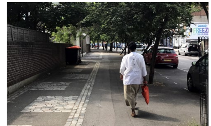
View east – footpath